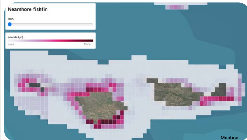
Modeled fisheries landings data for the Channel Islands nearshore finfish fishery at 1x1nm block resolution for 2005.

The project team developed a modeled spatial dataset to better understand fishing patterns in and around California MPAs between 2005-2020. Using a modeled dataset, proportion of catch in areas adjacent to MPAs increased from pre-MPA implementation years compared to post-implementation. Nearshore finfish saw a greater increase in modeled landings compared to urchin and lobster: the proportion of catch of finfish in adjacent areas was 7% in pre-MPA years (2005-2009), and increased to 15% in post-MPA years (2010-2020).