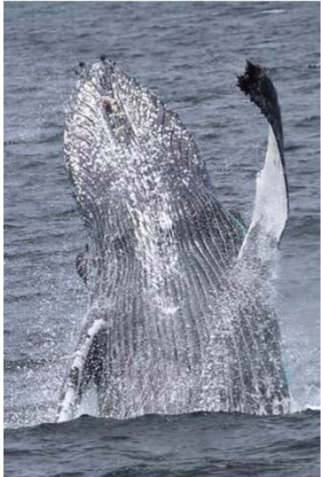
Humpback whales are frequent visitors to the California coast.

The Working Group identified improving the whale and sea turtle population densities and spatial and temporal distributions factor as a priority for assessing and mitigating risk. Additional key informational needs include verifiable data that improves understanding of whale and sea turtle movement and migration in relation to other risk factors; synthesis of available data sets to improve upon predictions of whale distributions in response to ecosystem variables; as well as whale behavior studies in the presence of fishing gear. Community science data, such as that collected by whale watching boats, may help inform population densities and distributions. The Working Group recommended synthesis of available whale watch data and comparison of this information with other whale sighting datasets to evaluate the utility of whale watch data in informing risk assessment and mitigation. 33 Improved fine-scale information on whale and sea turtle population densities and distribution can inform spatial and temporal scales of potential mitigation measures. As this data will be informative across other state-managed fisheries that may interact with whale and sea turtle species, it is important to develop this information from an annual or species-specific perspective to inform the management of fisheries other than Dungeness Crab.