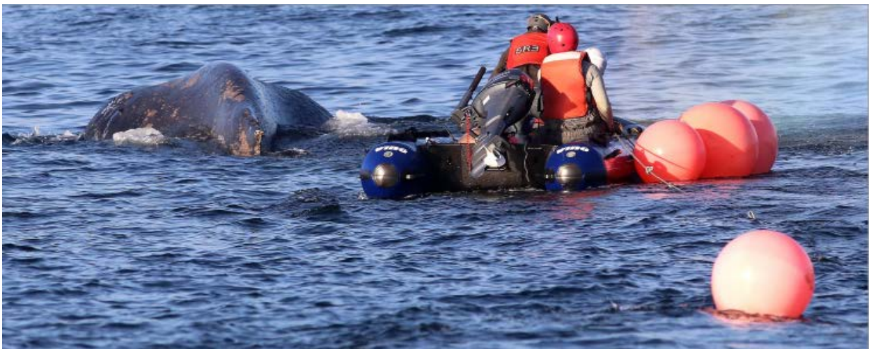
Trained disentanglement response team.

The West Coast Large Whale Entanglement responders participate in comprehensive training and apprenticeship to use appropriate techniques and abide by protocols to ensure their personal safety and the safety of the animals. In February 2019, NOAA Fisheries and TNC partnered to produce an online training course 43 for recreational and commercial boaters to provide guidance on how to respond to an entangled whale. The course serves as an introduction to the entanglement response program and includes an overview on how to identify whale species, observe whale behavior, and assess and document the entanglement through photographs and videos. While additional, extensive training is required to operate as part of the Large Whale Entanglement Response Network teams, this online course expands the knowledge of boaters on the water and increases the standardization of monitoring and entanglement documentation.