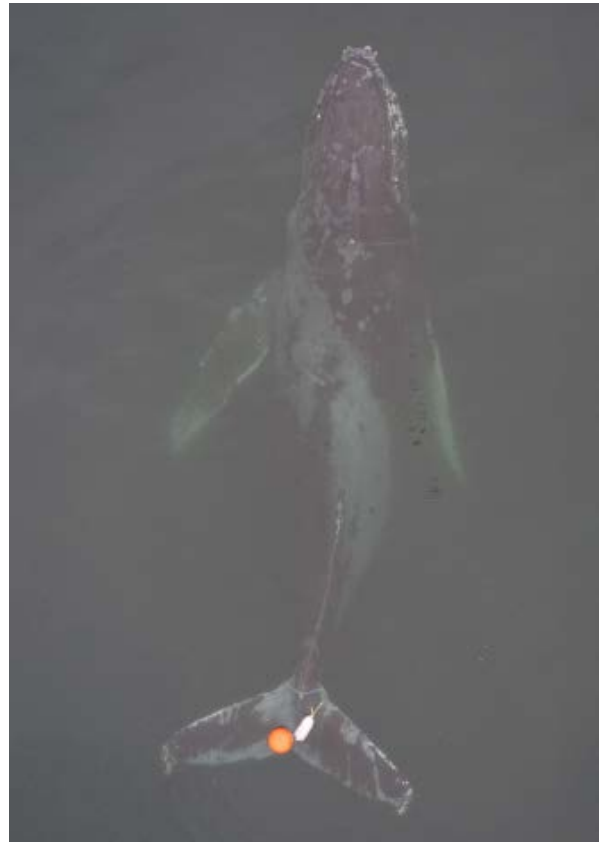
Humpback whale entangled in fishing gear. Photo: Duke University. NMFS, MMHSRP Permit 18786-03.

A variety of factors may contribute to the increase in the number of reported entanglements, including a complex relationship between the distribution, abundance and behavior of whales, environmental variability and prey distribution, and fishing effort distribution, as well as an increase in public awareness and reporting 12 . Whale species reported as entangled include Humpback whales, Gray whales, Blue whales, Fin whales, Minke whales, Sperm whales, and Orca whales. 13,14 Humpback whales have been the predominant species reported as entangled in recent years. The first confirmed Blue whale entanglement was report in 2015, with three reported in 2016, and three reported in 2017. Although there are many unknowns, multiple fisheries have been identified as having inadvertently entangled whales. 15 In 2018, there were 46 whales confirmed as entangled by NOAA off the West Coast, and seven were confirmed as dead (five Humpback whales and two Gray whales). In 2017, there were 31 whales confirmed as entangled by NOAA off the West Coast, and two of the confirmed entanglements involved Gray