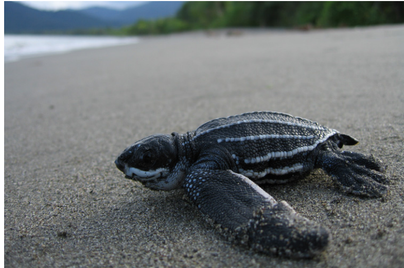
A hatching Leatherback sea turtle.

Humpback whale, Gray whale, Blue whale, and Leatherback sea turtles have been identified as key species based on CDFW and NOAA Fisheries priorities, and based on NOAA West Coast Whale Entanglement Summaries as the species most often reported as entangled in fishing gear. Therefore, key forage for these species is a high priority for improved information streams. Data on additional whale and sea turtle species’ prey may be important for further mitigation of entanglement risk.