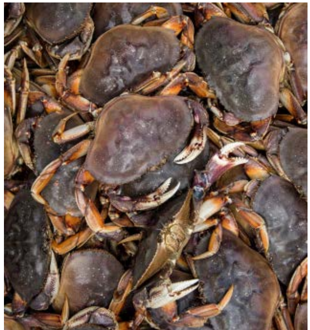
Dungeness crab are one of the top three fisheries in terms of both landings and value in California.

Additionally, the Working Group has made specific recommendations that have resulted in important regulatory and management changes. In their October 2016 Memo, 79 the Working Group supported "the efforts by the DCTF and CDFW to design and implement [a statewide lost fishing gear recovery] program as an important step towards reducing the risk of whale entanglements in lost Dungeness crab fishing gear." SB 1287 (McGuire, 2016), with revised and recast provisions via SB 1309 (McGuire, 2018), amends Fish and Game Code Section 9002 to require CDFW, in consultation with the DCTF, to establish a retrieval program to provide for the retrieval of lost or abandoned commercial Dungeness crab traps by June 30, 2019. CDFW's Trap Gear Retrieval