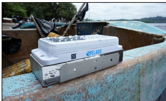
Screwed In Mount