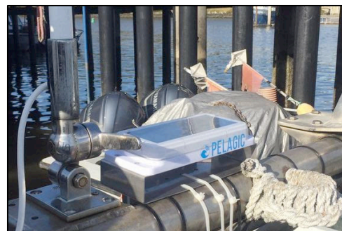
Zip Tied Mount