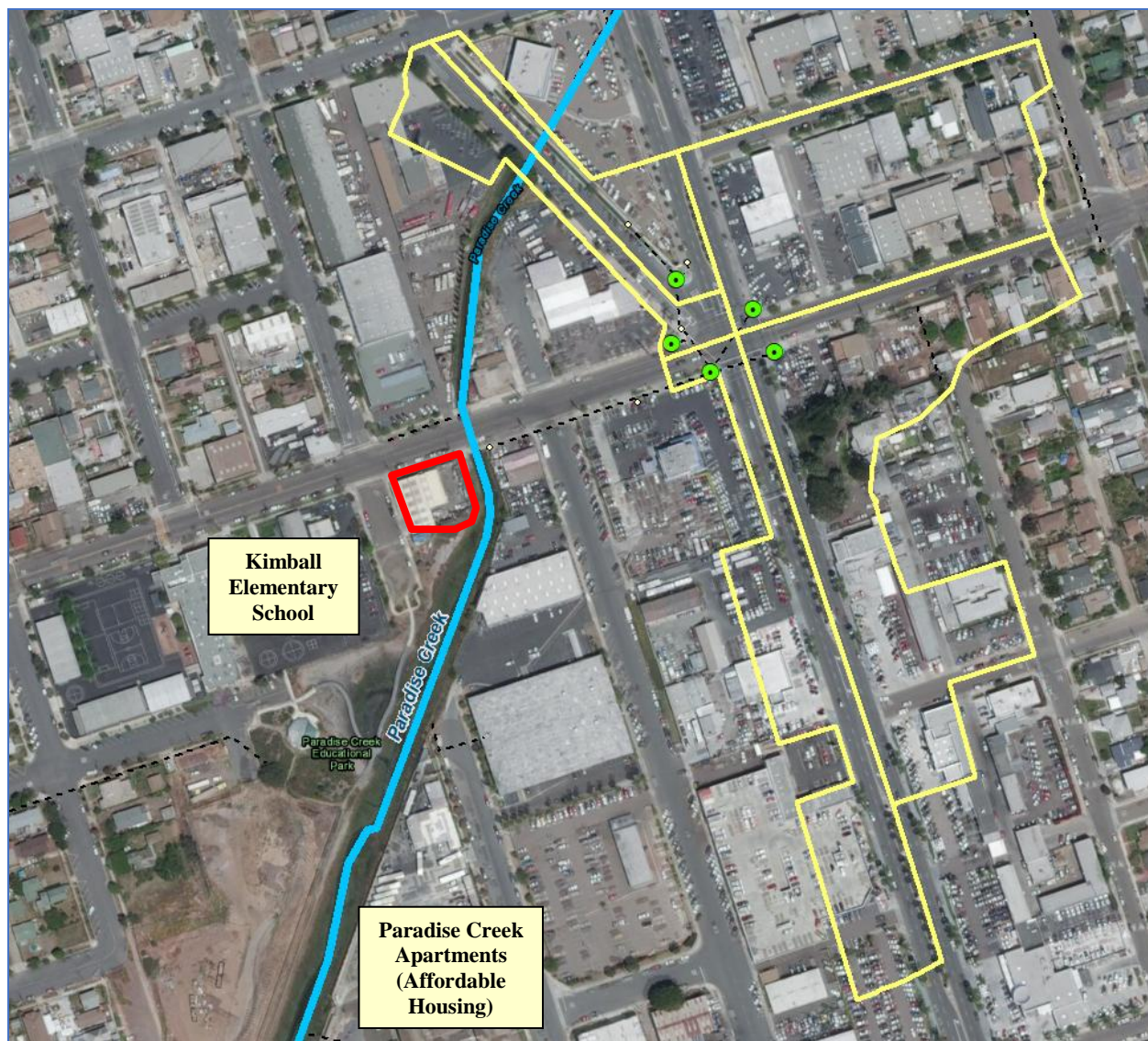
Trash Control BMPs Site Map. Project location ( red polygon ), storm drain pipes (black dashed lines), five trash control BMP locations ( green points ), and trash control BMP drainage areas ( yellow polygons ). The five trash control BMPs drain approximately 15 acres.