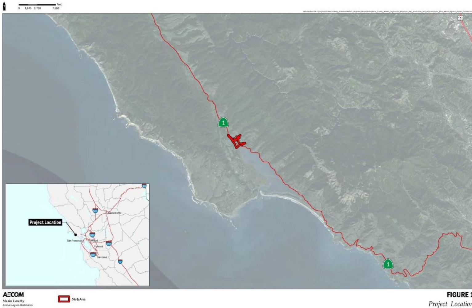
Figure 1 – Regional Map