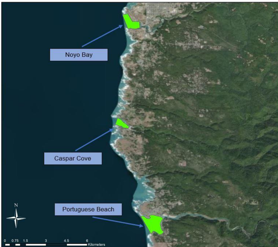
Figure 2. Kelp restoration sites in Mendocino County.

In close collaboration with CDFW, project will establish three kelp restoration sites in Mendocino County (Fig 2) at which purple urchins will be removed by commercial urchin divers over the course of one year. The efficacy of urchin removals as a kelp restoration tool will be assessed by comparing key ecological metrics before and after restoration efforts as well as between restoration sites and unmanipulated reference sites.