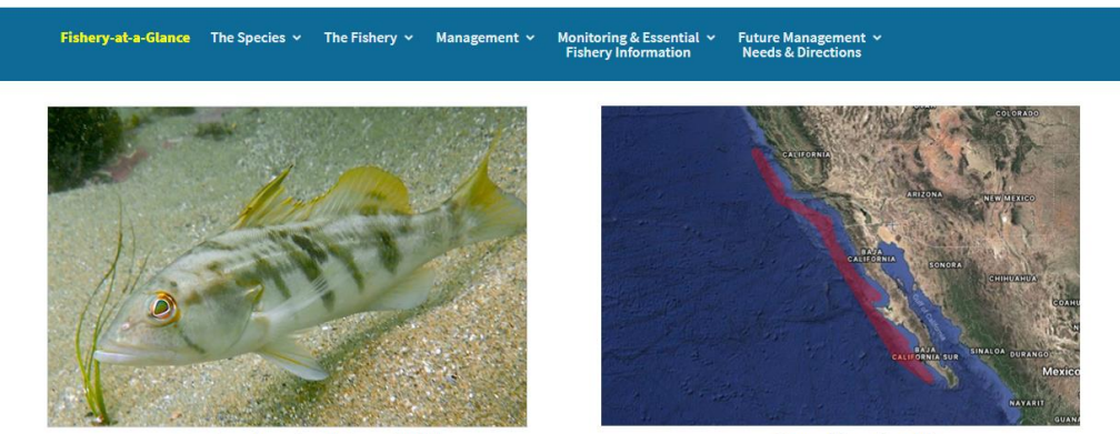
Barred Sand Bass (Paralabrax nebulifer)