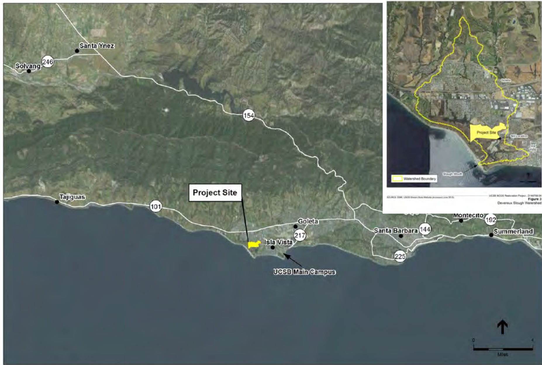
Figure 1. Regional and inset watershed and project location map for North Campus Open Space (NCOS) Coastal Wetland Restoration Project, shown in yellow as “project site”.