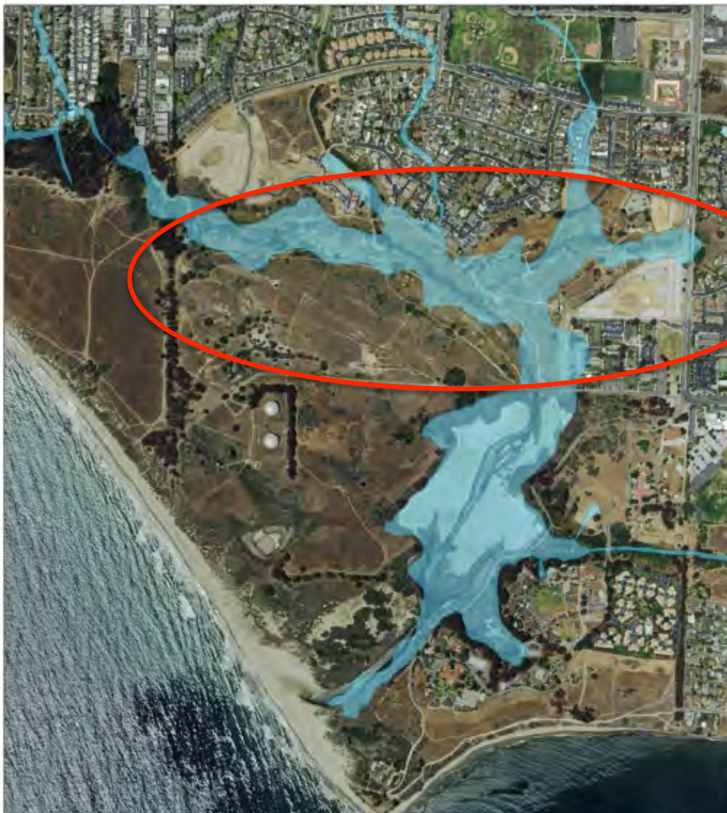
Figure 4. Projection of mapped original extent of Devereux Slough (1870 image in blue) projected on 1997 aerial photo of project site. Project location is circled in red.