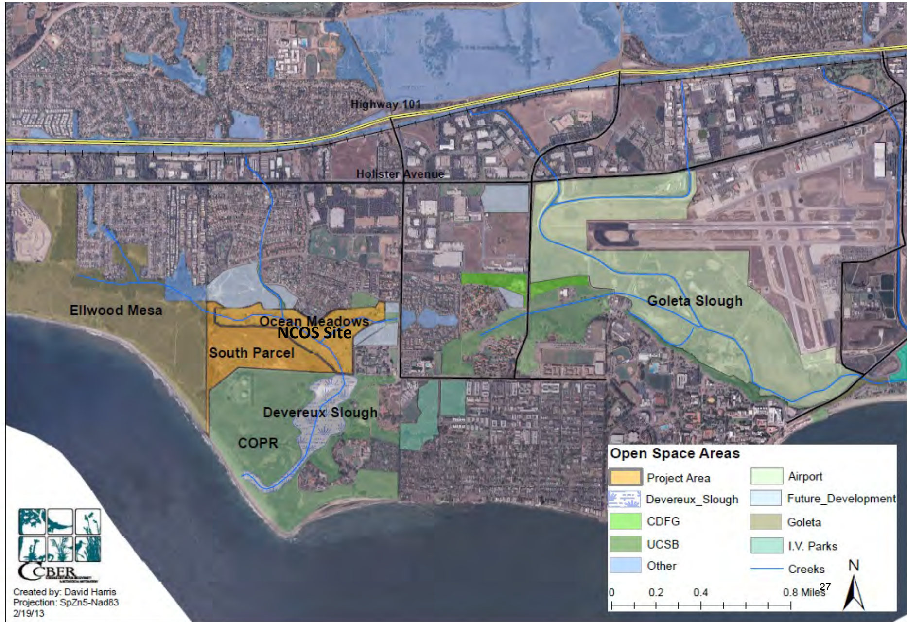
Figure 2. Close-up location map showing yellow “NCOS” project site within context of local open space, Devereux Slough to the south and UCSB main campus to the east.