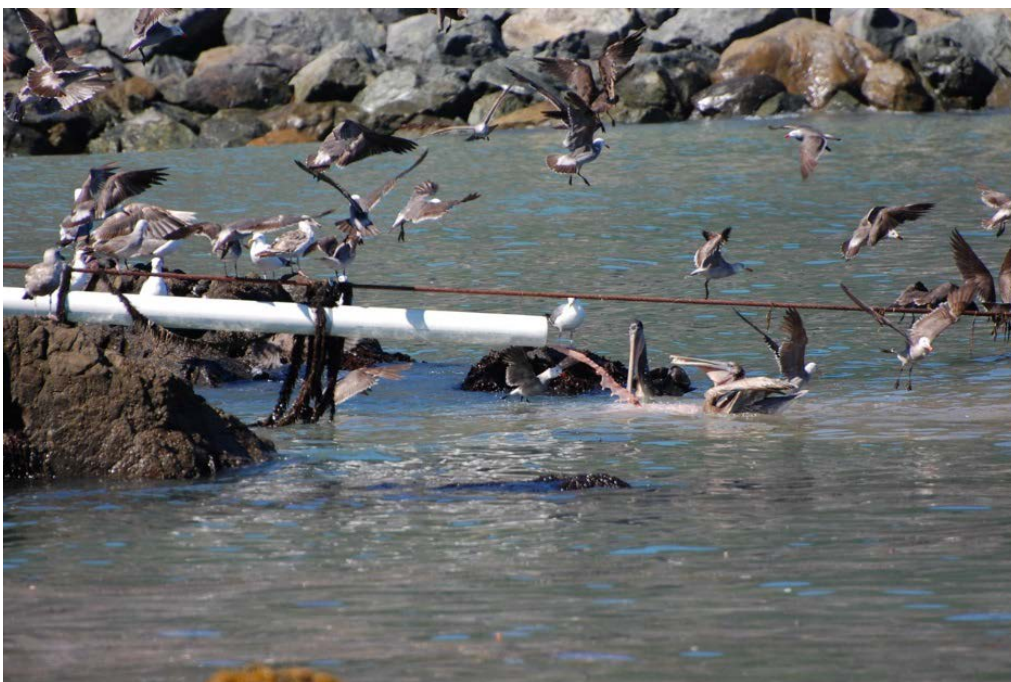
Figure 4. Photograph of seabirds congregating near fish waste disposal pipe at Shelter Cove, Humboldt County, California.