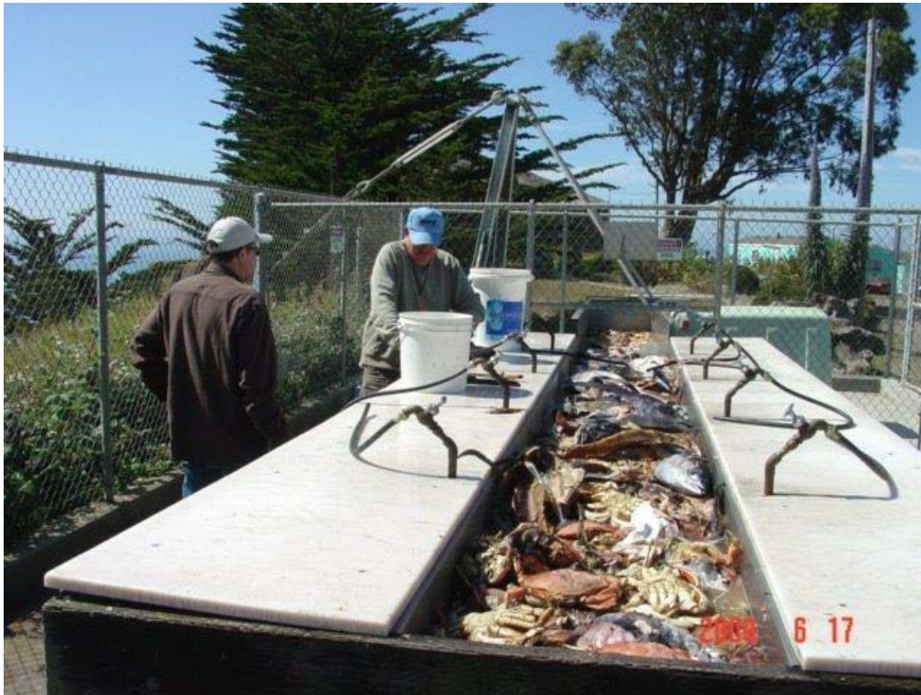
Figure 3. Fishermen using fish cleaning table at existing facility, Shelter Cove, Humboldt County, California.