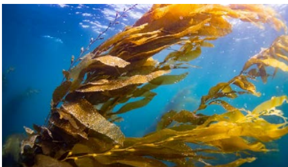
Kelp forests are an iconic and vital California marine ecosystem.

In addition, OPC has funded two smaller kelp-related projects through the Executive Director's delegated authority, both of which are now underway. These projects will directly inform the statewide kelp restoration toolkit. First – The Nature Conservancy is currently facilitating aerial surveys of kelp canopy cover (both surface and submerged) from Monterey to the California/Oregon border, and will also provide a comparative analysis of 2019 North Coast aerial and satellite imagery to inform long-term kelp canopy monitoring. Second – beginning this winter, scientists with Reef Check California will conduct urchin removals at two sites on California's North Coast to determine threshold urchin densities at which urchin barrens may be converted back to kelp forests.