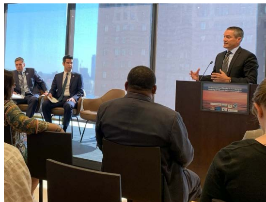
Secretary Crowfoot speaks at the UN Secretary General Climate Action Summit.

On September 25, Secretary Crowfoot spoke at the UN Secretary General Climate Action Summit Meeting of Climate and Ocean Leaders held during New York Climate Week. This summit convened national and subnational leaders following the release of the Intergovernmental Panel on Climate Change's Special Report on Ocean and Cryosphere and showcased example policy frameworks for increasing mitigation ambition, adaptation, and resiliency strategies heading towards COP25. Secretary