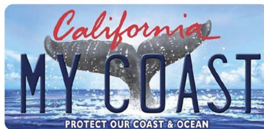
Revenue from the sale of "whale tail" license plates provides funds for coastal ecosystem and community resilience projects.

The Budget Act of 2018 included a $15 million appropriation of Environmental License Plate Funds to OPC to support projects that advance coastal ecosystem and human community resilience in the face of climate change. OPC has approximately $13 million remaining and will advance competitive and discretionary processes in 2020 to support cross-cutting climate change resiliency projects.