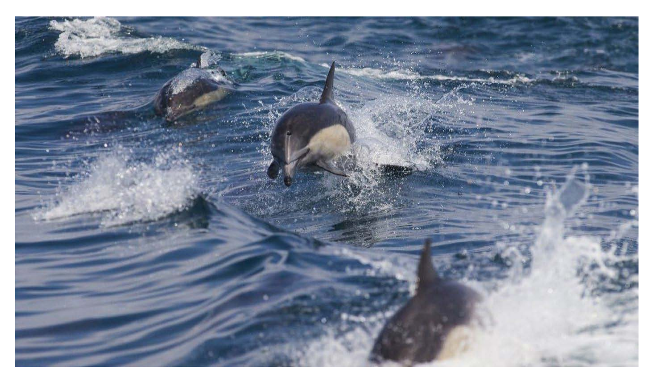
A pod of dolphins slices through the water near a whale-watching boat off the coast of Long Beach.

The search for offshore oil begins with a boom.