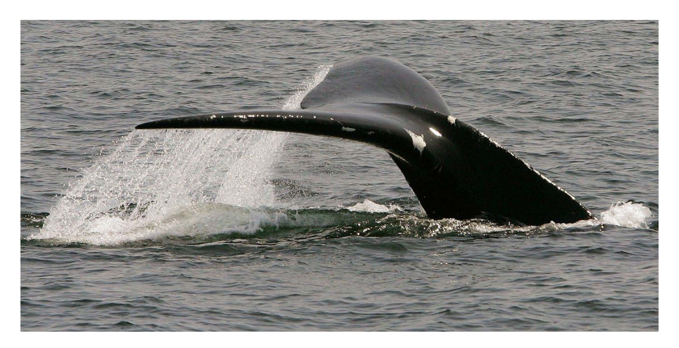
The North Atlantic right whale is one of the world's most endangered large whale species, with about 450 remaining.

Obtaining a seismic testing permit under the law can be a years-long process and requires companies to show their operation will have the "least practicable impact" on only "small numbers" of animals. Mitigation measures are strict and err on the side of precaution; ships have to turn off the blasts if whales are seen nearby.